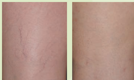
Before Leg Vein Therapy