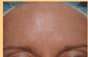
Patient 1 month after Mohs surgery, reconstruction and laser treatment