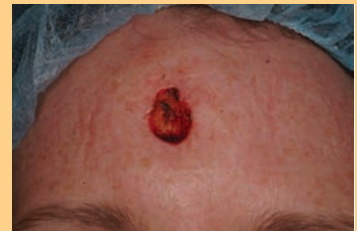
Basal Cell Carcinoma removed using Mohs surgery