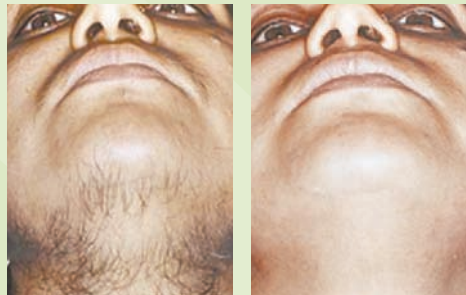
Before Laser Hair Removal After Laser Hair Removal