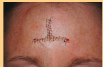
Reconstructive surgery after Mohs surgery