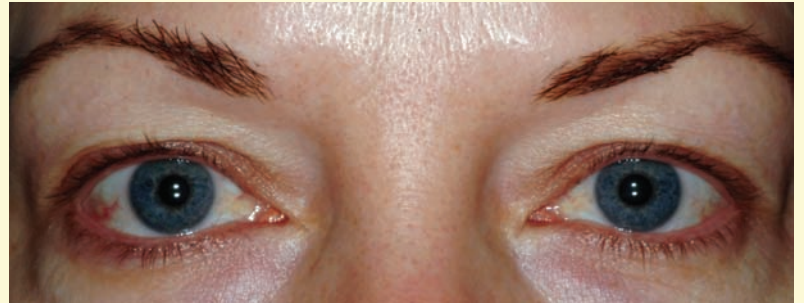
Before Eyelid Lift

The visible signs of aging can be daunting, and the eyes are generally the first area on the face to show unpleasant fine lines, wrinkles and lax skin — not to mention a puffy, swollen or bulging appearance. If you are looking for dramatic, long-term results, an Eyelid Lift can take years off your appearance.