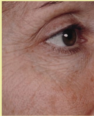
Before Fraxel re:pair