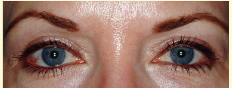
After Eyelid Lift

EXTRA FOLDS, FATTY DEPOSITS, BULGING AND MORE! As we age, the skin loses its elasticity and fatty deposits around the eyes become more prominent. More specifically, the natural crease in the upper eyelid becomes lost, creating an extra fold or "hood", possibly even covering the eyes and eyelashes. Fat cushions also develop as the thin membranes in the skin allow the fat to protrude into the lids. And, loss of bone and facial structure may cause the soft tissue surrounding the eyes to drop and sag.