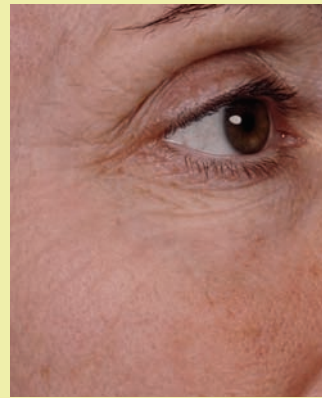
After Fraxel re:pair