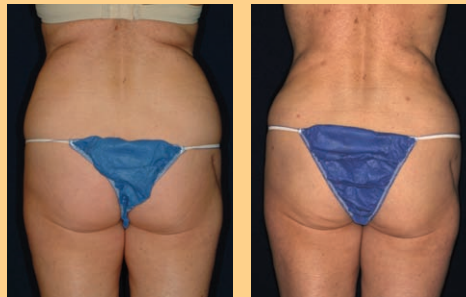
Before MicroLiposculpture After MicroLiposculpture

SPECIAL – For a more youthful shape. Schedule a Tumescent MicroLiposculpture treatment between September 12 and November 11, 2011 and receive 20% off!*