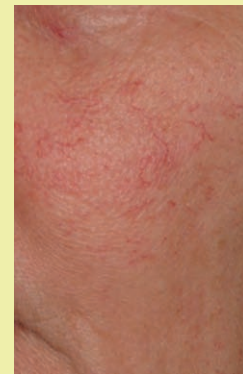
Before IPL and Vbeam Treatment