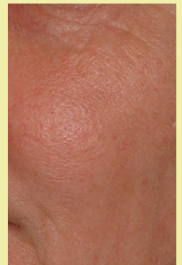
After IPL and Vbeam Treatment

are also numerous safe and effective topical treatment options available for combating various pigmentation problems, such as hydroquinone, tretinoin, AHA's and kojic acid. A Glycolic Peel Series can also be an excellent approach for treating pigmentation problems.