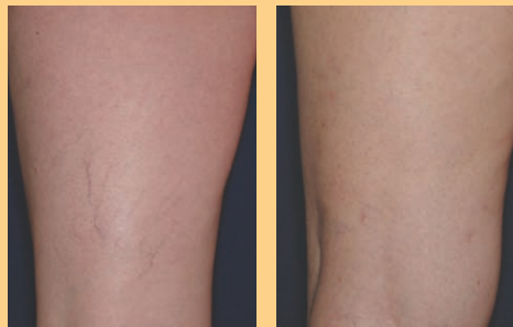
Before Sclerotherapy After Sclerotherapy

SPECIAL – For better looking legs. Schedule two or more sclerotherapy treatments between September 12 and November 11, 2011 and receive 20% off.*